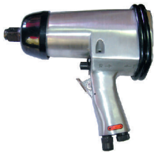
TIW - 27