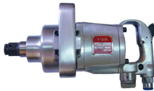
TIW - 48