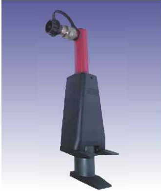
▲ HS10K Hydraulic Model

With the Hydraulic Power-Spreader, HS10K, a hydraulic cylinder replaces the ratchet handle. A standard hand pump powers 1 Power-Spreader, or a pair, with ease. Again, you are supplied with 4535 kg (10,000 lbs) of force and 76.2 mm (3") of gap; ample for gasket replacement or turning of blinds.